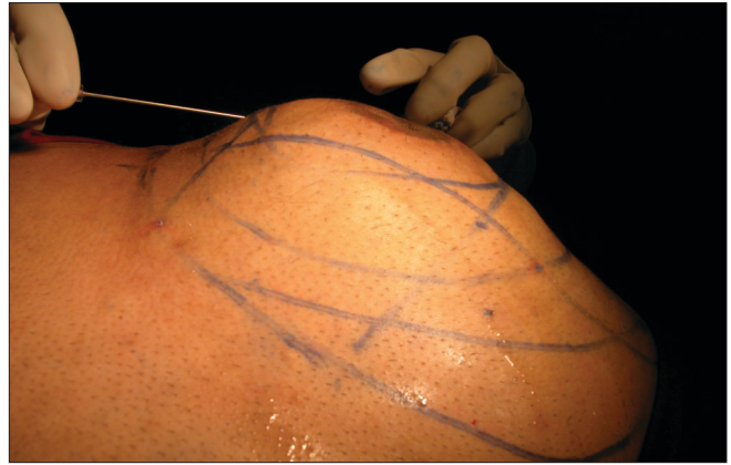
Figure 3: Infiltration of tumescent fluid