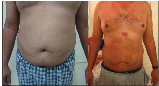
Figure 8: Results of case 2