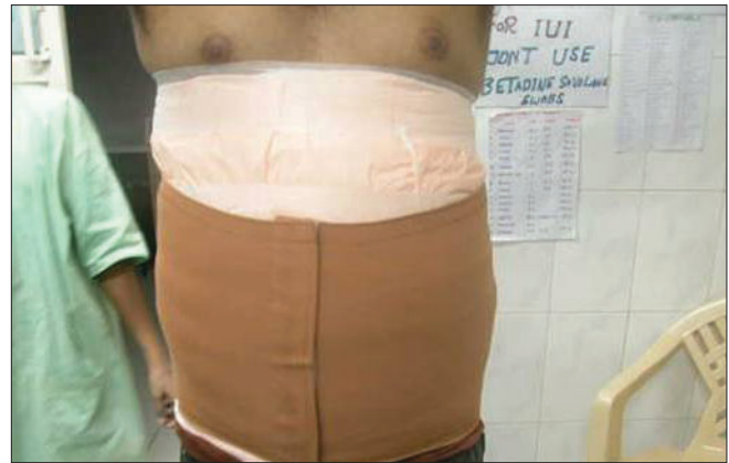
Figure 6: Postoperative pressure dressing

the patient engaged by having a television or music in the theatre during the entire procedure.