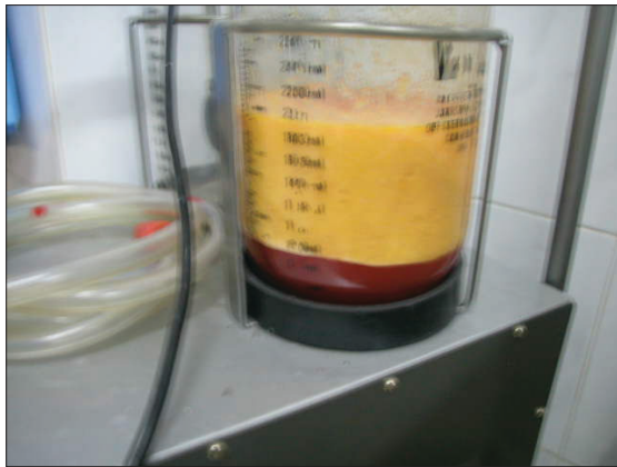
Figure 5: Fat aspirated; note the small amount of blood