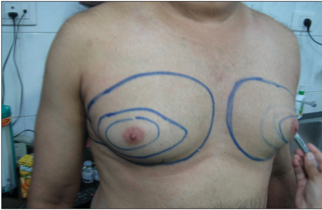
Figure 2: Topographic marking