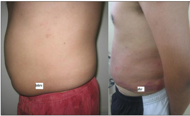
Figure 7: Liposuctions results, case 1