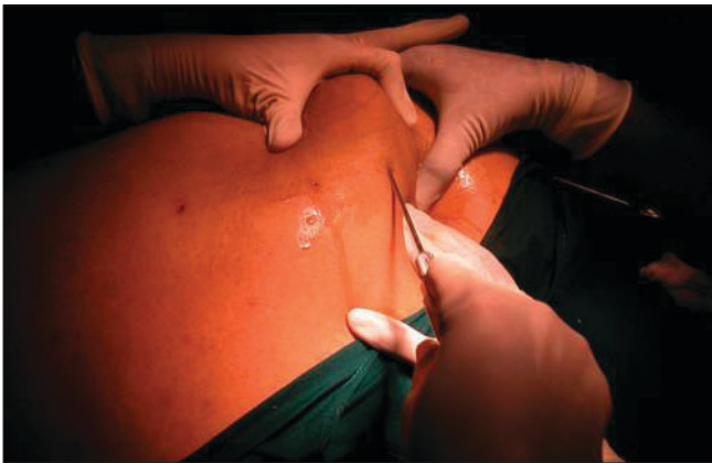
Figure 4: Aspiration of fat

administered preoperative antibiotics such as cephalexin, and a tranquillizer such as oral lorazepam 1 mg. Oral Clonidine 0.1 mg is also administered to prevent epinephrine-induced tachycardia and as an adjuvant anxiolytic drug. The area for liposuction is topographically marked with marker ink to delineate the bulges and asymmetry [Figure 2]. Preoperative photography is vital.