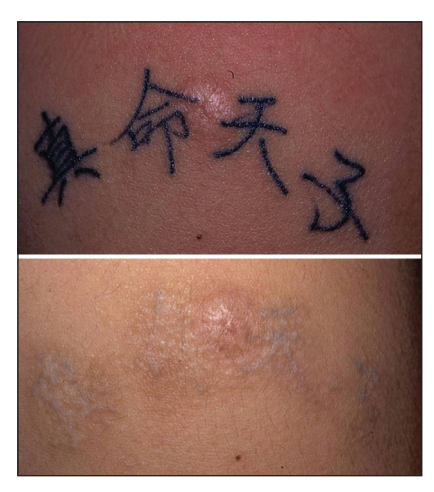
Figure 1: Showing good resolution of dark blue tattoo using the QS Nd:YAG laser after 5 treatment. Noticed textural changes and mild post inflammatory hyperpigmentation and silhouette of old tattoo

absorption by epidermal melanin and reduce the risk of complications.