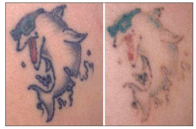
Figure 5: Show multicolored tattoo partially removed with the QS Nd:YAG laser. Note persistence of green pigment which are generally unresponsive to Nd:YAG laser.

Lapidoth et al. treated 404 Ethiopian patients (skin types V and VI) with blue/black tattoos with the 1064 nm QS Nd:YAG (380 patients) or QS ruby laser (24 patients), and reported a clearance of 75-100% in 92% of patients after 3-6 laser treatments (average 3.6) at intervals of at