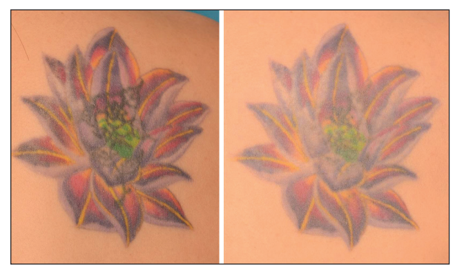
Figure 4: Difficult to treat multi-colored tattoo on the back, before and after 4 treatments with 755 nm QS Alexandrite laser