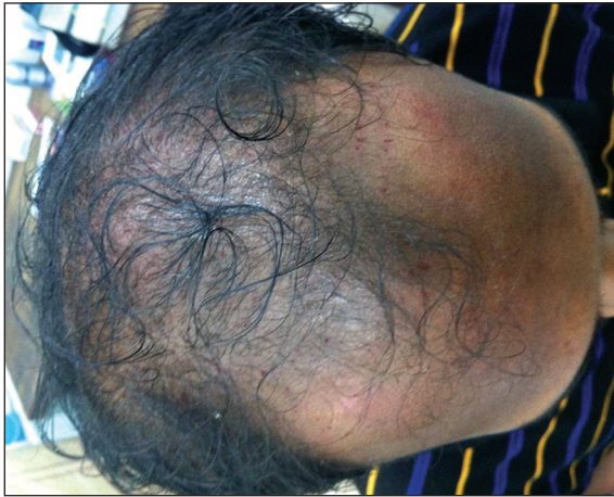
Figure 3: Pre-treatment clinical photograph

oral finasteride (FDA approved) either alone or in combination. [6,7] However, there are several reported side effects such as headache and increase in other body hairs for minoxidil [6] whereas loss of libido has been reported with oral finasteride. Finasteride also interferes with genital development in a male fetus and is contraindicated in pregnant women and those likely to become pregnant. [7,8]