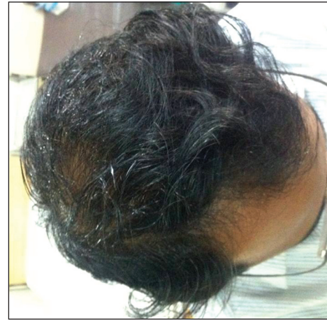
Figure 4: Post-treatment clinical photograph

Uebel et al. observed a significant improvement in hair density and stimulation of growth when follicular units were pre-treated with platelet plasma growth factors before their implantation. There was a significant