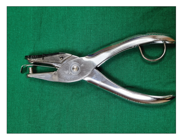
Figure 1: Ticket punch.

Axillary hyperhidrosis is treated by injecting 50 units of botulinum toxin A into each axilla. Botulinum toxin is reconstituted with normal saline to reach a concentration of 20 units/mL. It