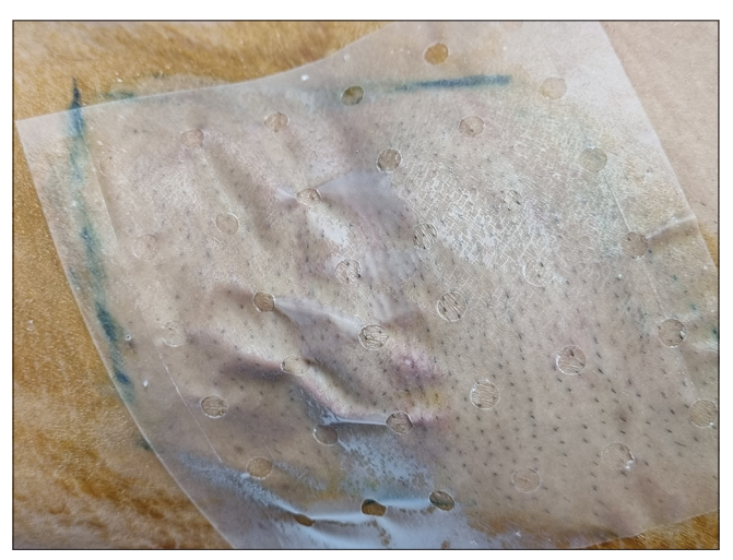
Figure 3: Adhesive on the skin.

is injected at a distance of 1–2 cm distance. These points are marked by marking points with a pen and ruler or drawing vertical and horizontal lines a centimeter apart to form a grid and injecting them at the intersection.<sup>2,3</sup> This technique is tedious for the surgeon. Marking the injection points on transparent dressings overcomes this issue.1 However, this tends to blunt the needle, making the injections more painful. The area of hyperhidrosis was identified by the starch iodide test. Adhesive tape for occlusion often comes complementary with the eutectic mixture of local anesthesia that we use to numb the area. We have used a ticket punch [Figure 1] to punch holes at a 1-2 cm distance over a sheet of adhesive tape meant for occlusion that would cover the affected area [Figure 2]. The holes form a grid. The backing is removed and the adhesive tape is then pasted over the cleaned field of injection [Figure 3]. The botulinum toxin is then injected