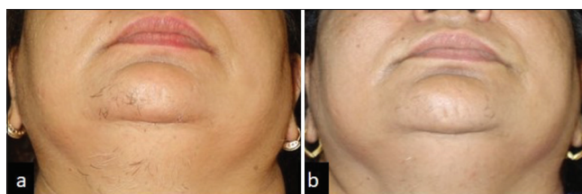
Figure 2: (a and b) Pre and post procedure pictures of leukotrichia treated with self-made insulated needle.