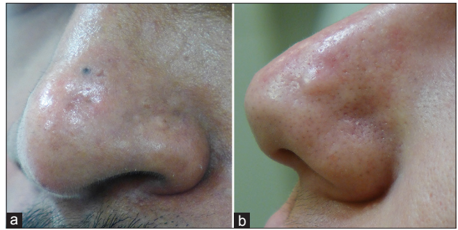
Figure 1: (a and b) Representative examples of papular acne scars of the nose

To our knowledge, this is the first series of patients described and characterised with soft papular acne scars of the nose