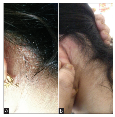
Figure 2: (a) Fleshy papules over scalp and retroauricular area (pretreatment). (b) Post-treatment

retroauricular regions. In the first sitting, the nasolabial lesions were targeted. Topical anesthesia (combination cream of tetracaine and lidocaine) was applied an hour prior to procedure. CO<sub>2</sub> laser at 7.0 W with a 100 mm hand