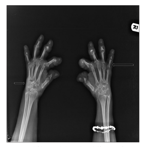
Figure 4: X-ray bilateral hands oblique view, showing extensive scalloping and partial absorption of distal and middle phalanges

piece (1.0 mm spot size) in superpulse mode was used to ablate the lesions. There was no significant bleeding during or postprocedure. Topical antibiotic cream (fusidic acid 1%) was applied after the procedure. A follow-up after 3 weeks revealed that the skin had healed with no significant hyperpigmentation or scarring [Figure 1b].