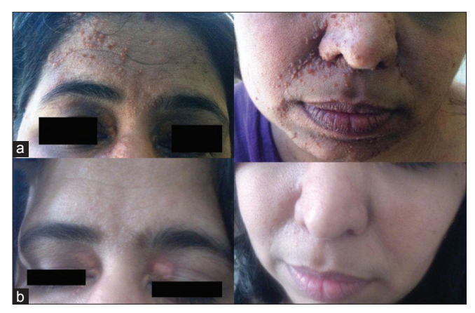
Figure 1: (a) Multiple fleshy papules over the face (pretreatment). (b) Post-treatment