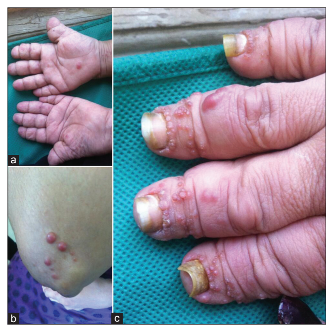
Figure 3: (a) Mutilating arthritis with nodules over palms with shortening of fingers, (b) Nodules over the elbow. (c) Lesions over nail folds in a "coral bead" configuration