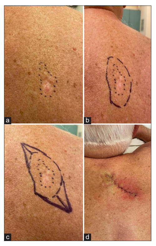
Figure 5: (a) Edges of skin lesion marked, (b) marking with adequate excision margin, (c) making an ellipse in the direction of resting skin tension line, (d) post-excision of lesion

1. The intent of the procedure, diagnostic or therapeutic, determines the margin for excision.