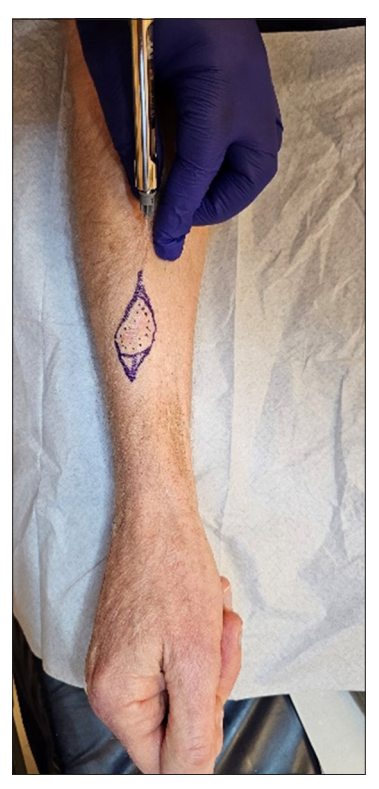
Figure 1: Administering local anesthetic agent in the direction of sensory nerve.