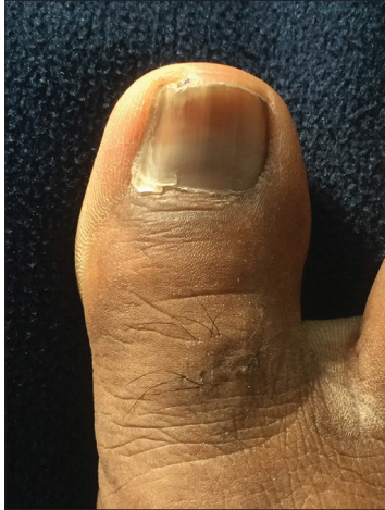
Figure 2: The ingrown nail splinted with cyanoacrylate glue.