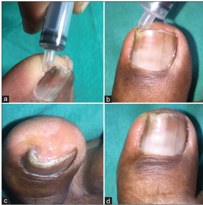
Figure 3: (a-d) The procedure to use the syringe for separating the distal part of ingrown nail plate from its gutter, which is helpful in chemical splinting the nail with cyanoacrylate glue.

procedures that use available nail separators and elevators to separate the nail plate. In this article, we introduce a new disposable device for separating the nail plate during ingrown nail splinting.